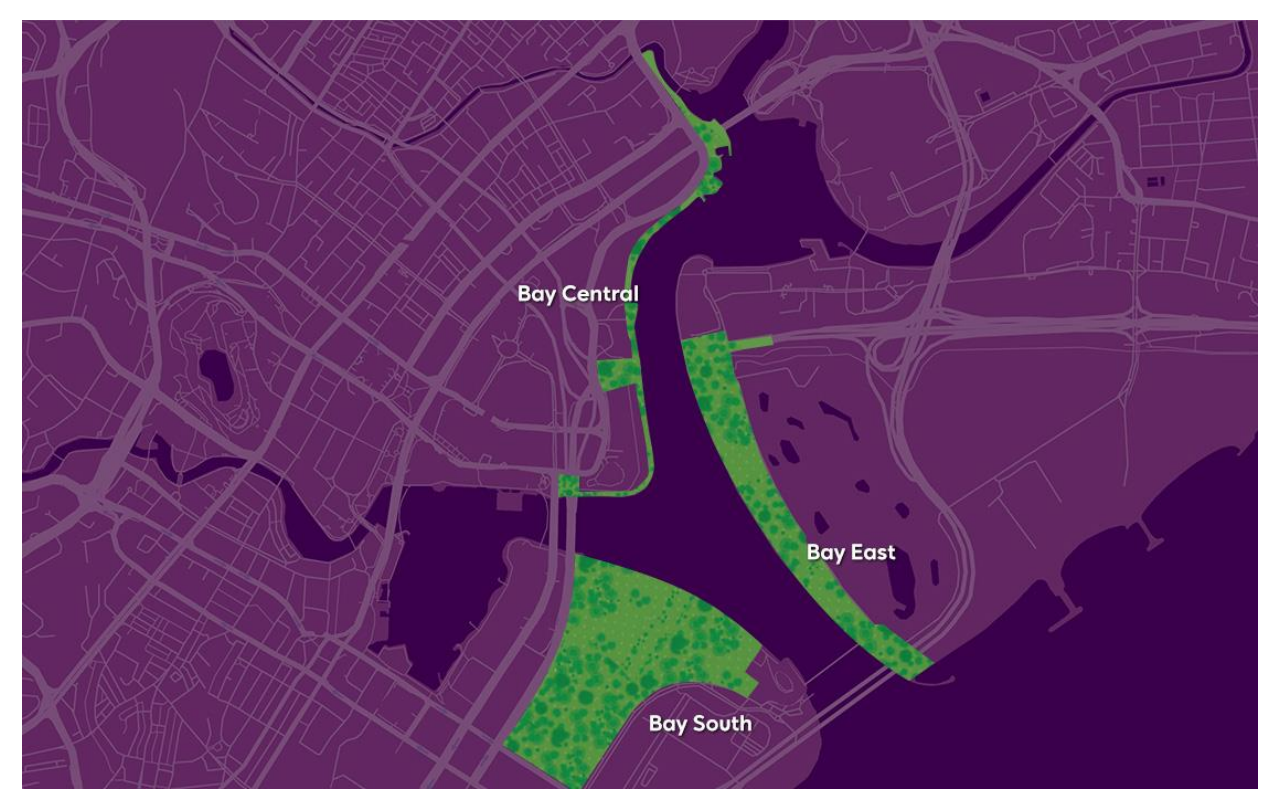
Figure 1. The three waterfront gardens at Gardens by the Bay in Singapore: Bay South, Bay East, and Bay Central.

Bay South, the largest of the three gardens with an area of 54 hectares, opened in 2012. With its award-winning, cooled conservatories and iconic Supertrees, Bay South has placed Singapore squarely on the international map and is a source of national pride. Within Flower Dome, the everchanging floral displays including crowd favourites such as Tulipmania, Orchid Extravaganza, and Cherry Blossoms bring the beauty and diversity of the plant kingdom to life for all to enjoy.