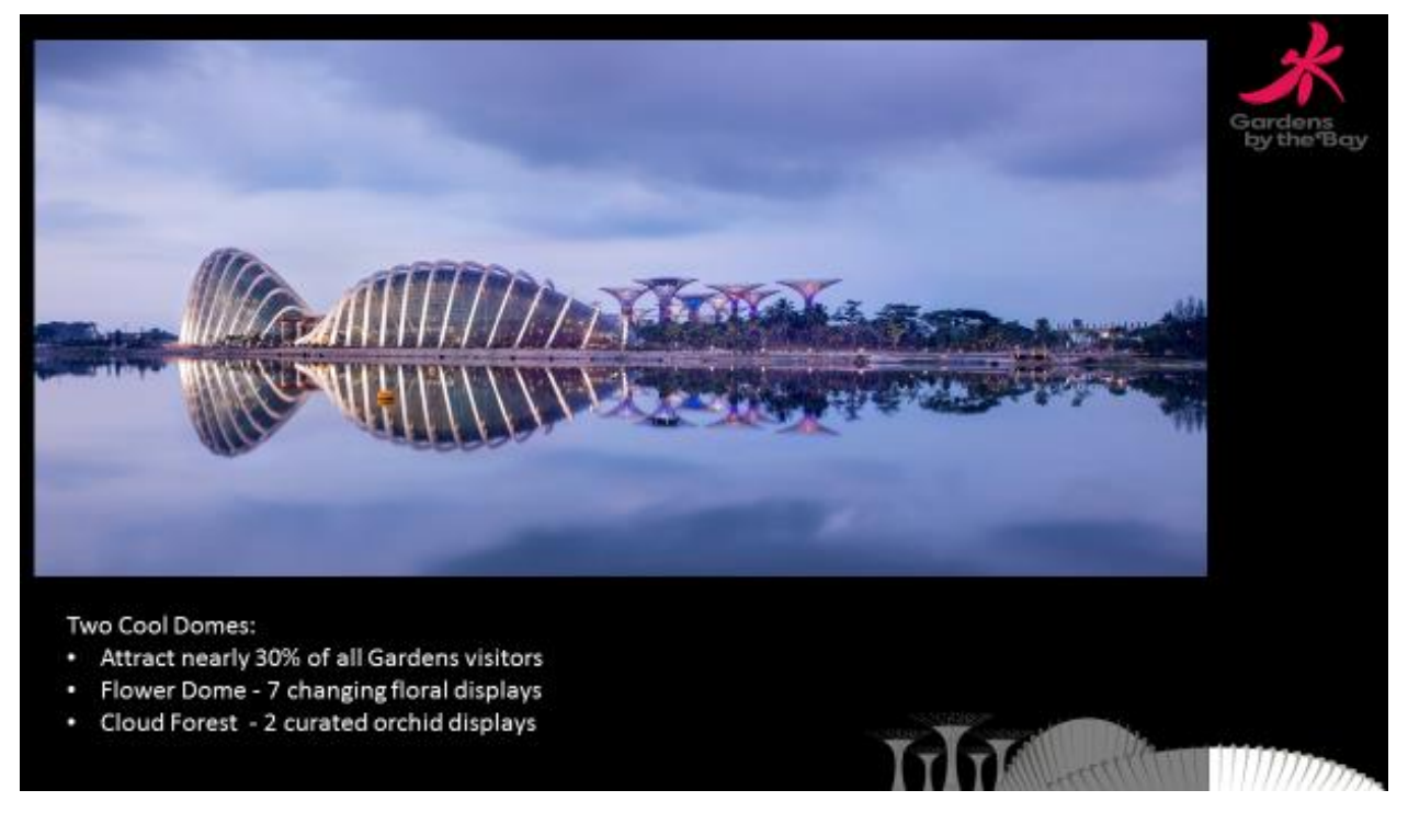
Figure 3. View of the two conservatories at Gardens by the Bay in Singapore: Flower Dome and Cloud Forest.